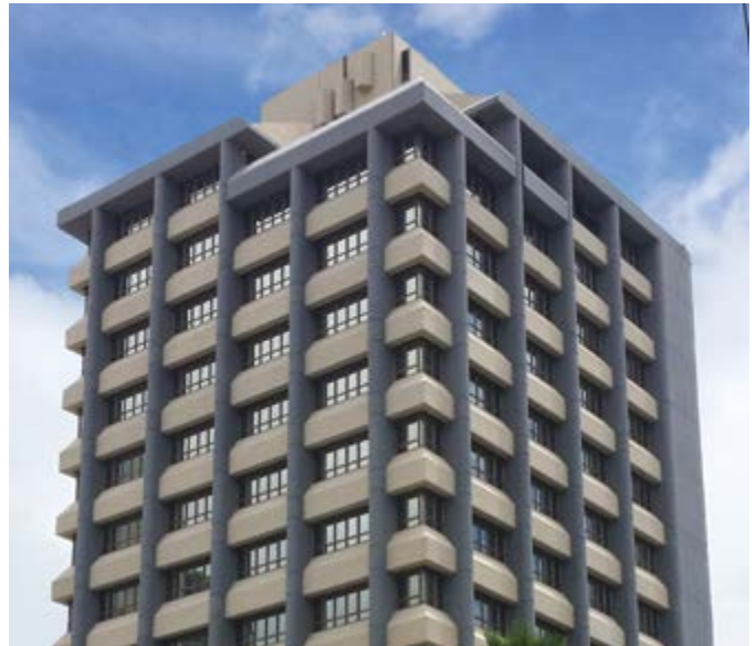
Reserve Bank of Fiji Architect: Architects Pacific Limited